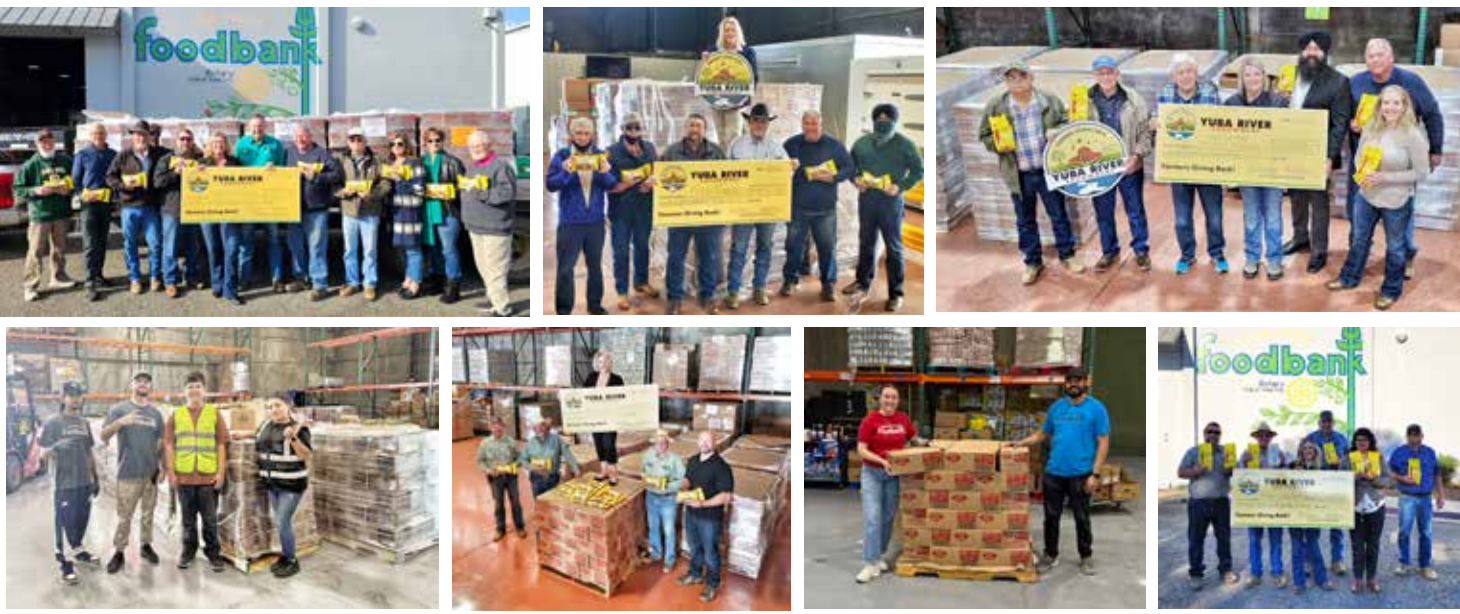
Photos from some of the nine donations, each totalling 16,000 pounds of locally grown rice, headed to the plate of locals in need.

To learn more about the Yuba-Sutter Food Bank, visit www.feedingys.org .