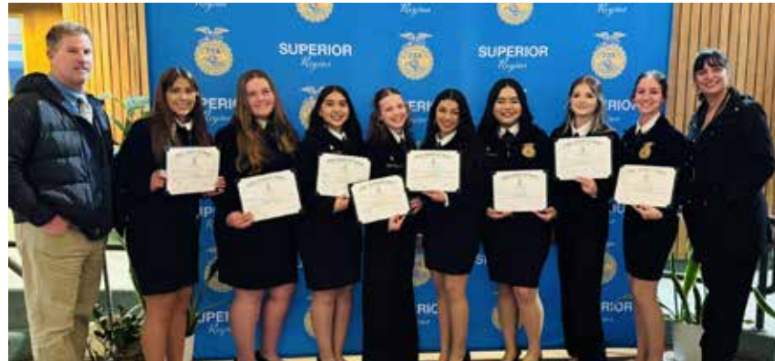
ABOVE: A record-setting eight students received their California State Degree in 2025.