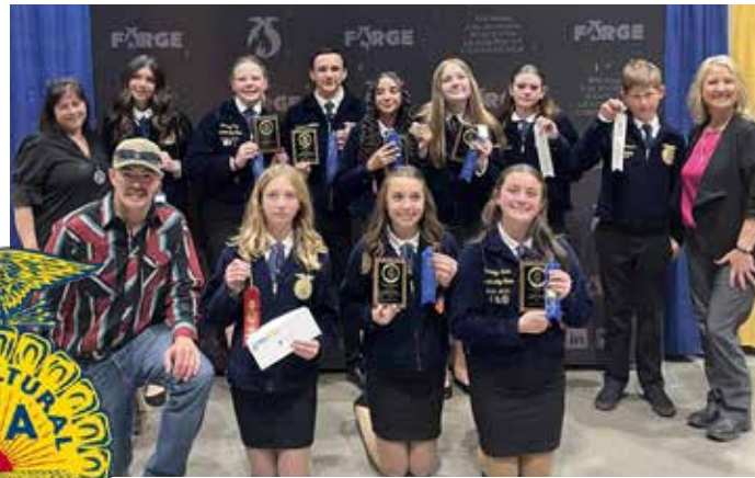
ABOVE: State winners! Wheatland Bear River FFA celebrated five state champions and three overall team wins. Headed to Nationals!