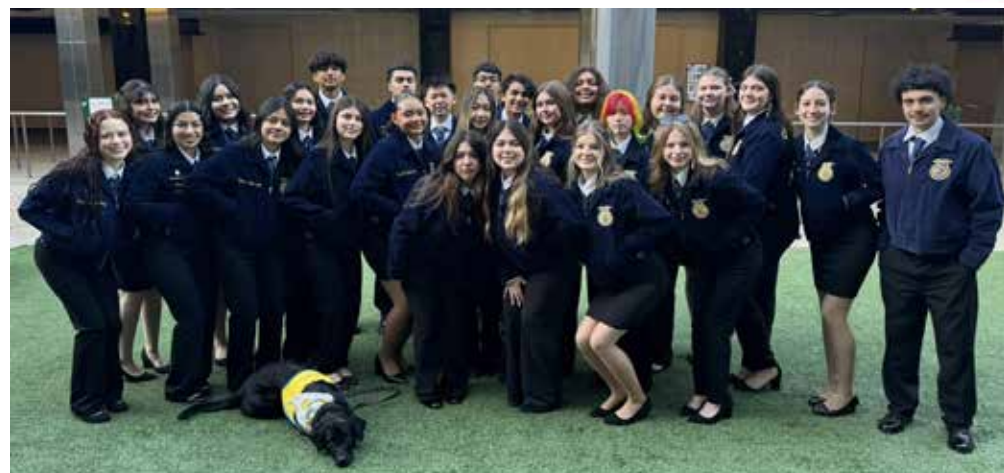
RIGHT: 27 Lindhurst High FFA members attended the 2025 State Conference