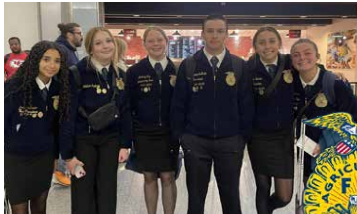
ABOVE: Six Wheatland Bear River FFA students attended National Convention in Indianapolis.