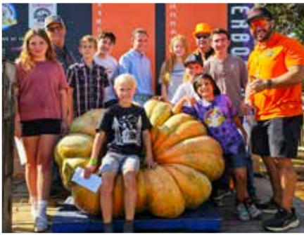
ABOVE: The top 10 Future Farmers pose with Trevor, age 9, who took the top prize of $1000 with this 825.5 lb giant.