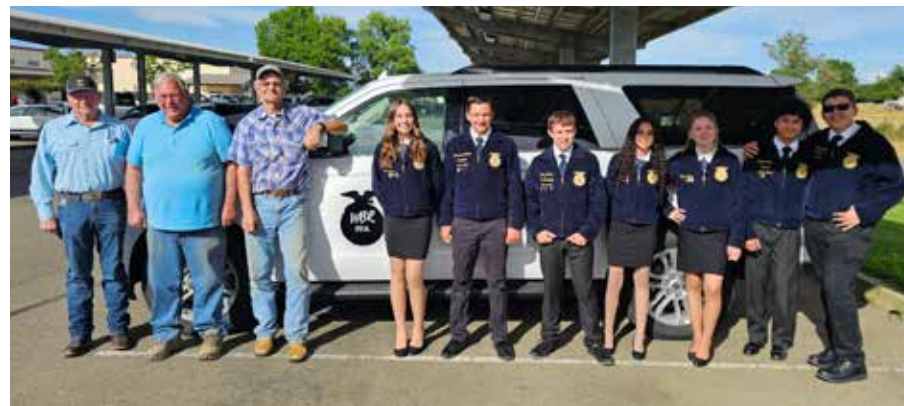
ABOVE: Endowment board members stand with Bear River FFA students in front of their brand new ride! Courtesy of a $25,000 donation from the Endowment, and a matching California Department of Food & Agriculture grant.

In March, the Endowment contributed $25,000 to the program. They combined this with $25,000 from a California Department of Food & Ag grant to purchase a dedicated SUV for the program.